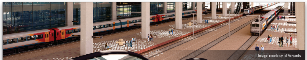
Voyants implements collaborative digital workflow to design iconic station for Indian Railways.

For additional information, and to read about the extraordinary projects designed using OpenBuildings Station Designer, visit https://www.bentley.com/openbuildings-station-designer/